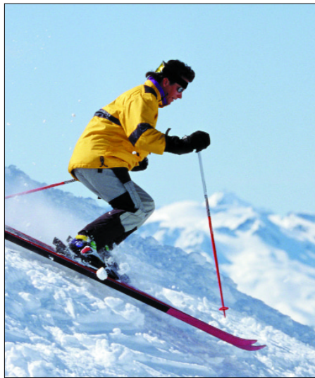
Fighting friction – waxing your skis is not the only way to increase your speed on the slopes.

Take, for example, horse-riding. For centuries, horseshoes have been used to protect horses' hooves from wear and tear. But traditional steel horseshoes reduce the natural shock-absorbing properties of the hoof and can therefore cause damage to the animal's lower limbs, especially on hard surfaces such as roads. As a result, modern-day “blacksmiths” have been developing an alternative to steel shoes based on polymers, which are lighter and more elastic. Polymer horseshoes can therefore accommodate the deformation of the hoof during movement, but they have one major drawback: they